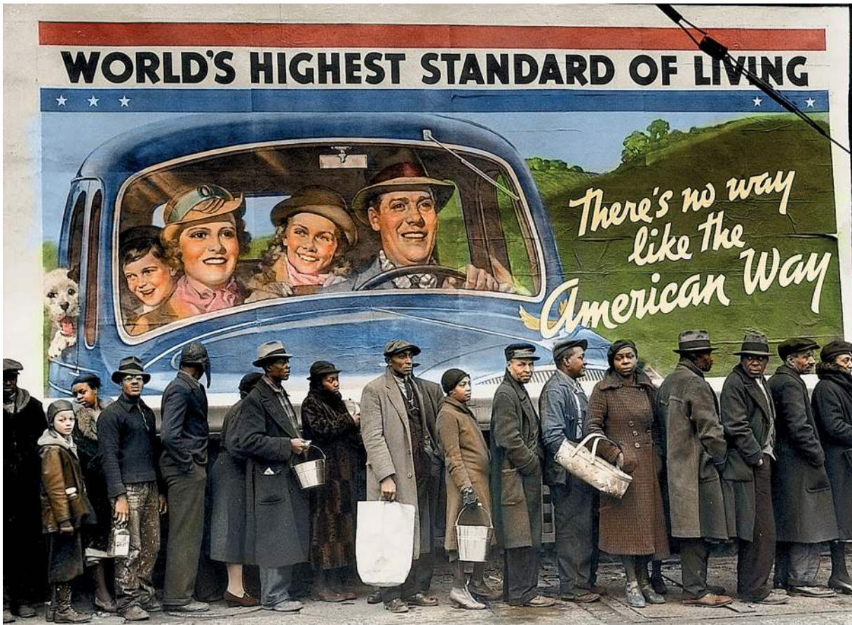
A photograph taken in Louisville, Kentucky, 1937. People wait in line for food and clothing from a relief station in front of a billboard.